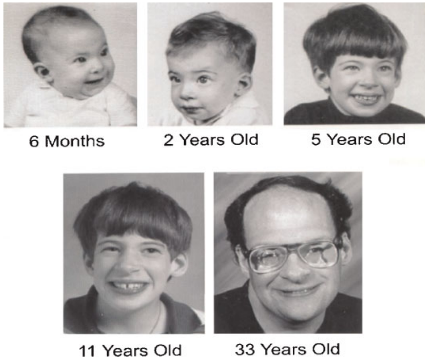
FIG. 2. Picture of male with 49,XXXXY from childhood to adulthood. Note the change in physical appearance with age.

Muldal and Ockey [1960] described the 48,XXYY karyotype as the “double male.” It is the most common variant of KS, representing 2.3% of patients with KS [Hasle et al., 1995]. The incidence ranges from 1 in 17,000 to 1 in 50,000 males [Sorensen et al., 1978; Nielsen and Wohlert, 1990]. Males with 48,XXYY are tall with an adult height over six feet, typically exceeding males with 47,XXY. They have eunuchoid habitus with long legs, small penis and testicles, hypergonadotropic hypogonadism, and gynecomastia. Peripheral vascular disease may cause leg ulcers and varicosities [Linden et al., 1995]. Their IQs range from 60 to 80, with 10% having an IQ above 80 [Sorensen et al., 1978]. Global developmental delay and severe expressive language disability are common. Behavioral features range from shyness to aggressiveness based on several reported case studies [Linden et al., 1995].